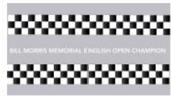
BILL MORRIS MEMORIAL ENGLISH OPEN CHAMPION