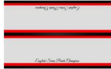
ENGLISH SERIES POINTS CHAMPION.