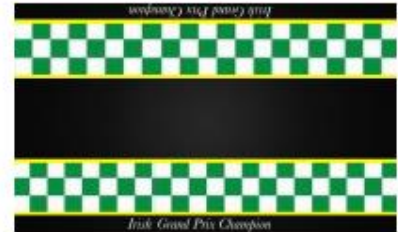
IRISH GRAND PRIX CHAMPION